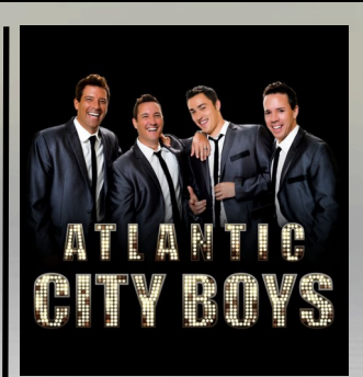
Atlantic City Boys Concert Fri. Feb. 7th 7:00PM $20 Advance Tickets