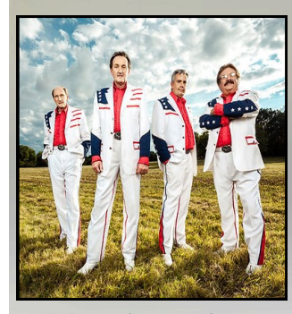
American Pride Statler Brothers Tribute Fri. Jan. 31st 7:00PM $20 Advance Tickets