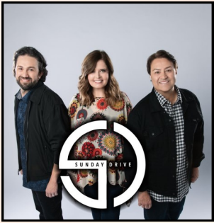
Sunday Drive Concert Fri. Oct. 25th 7:00PM