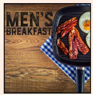
Men's Breakfast Thur. Oct. 17th 8:00AM Sign up by Oct. 13th

Billy "Elvis" Lindsey Alzheimer's Benefit Concert Fri. Oct. 11th 7:00PM